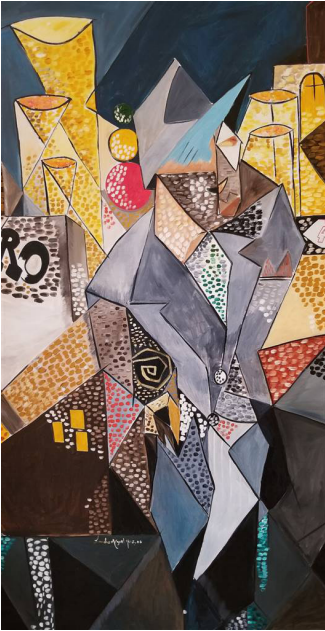
Broadway , 2005 Oil on Canvas 72" x 48"