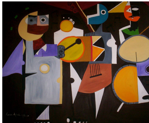
Merengue , 2006 Oil on Canvas 60" x 72"