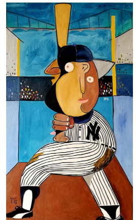
Yankee at the Plate , 2008 Oil on Canvas 60" x 36"